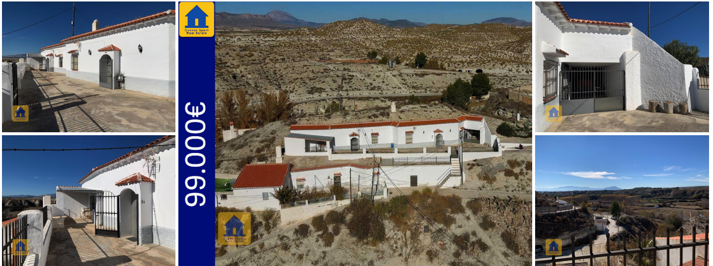
Cueva Yolanda Castilléjar

Fantastic cave house with stunning views of the badlands across the valley! The cave is very large and can be separated into 2 units, each with its own entrance, kitchen and bathroom. A private driveway leads to the gate and onto an expansive terrace with wide open views and a cozy covered sitting area at the far end. To the right upon entering the patio is the garage with a door leading into the house (The garage is currently used for wood storage.) There is a pantry/bodega and a laundry room. The property also has an underground room used for storing wood, and another cave with 2 rooms that was used for animals in the past and now has wood storage, accessible from the main road. There is ample space to park several cars on the property.