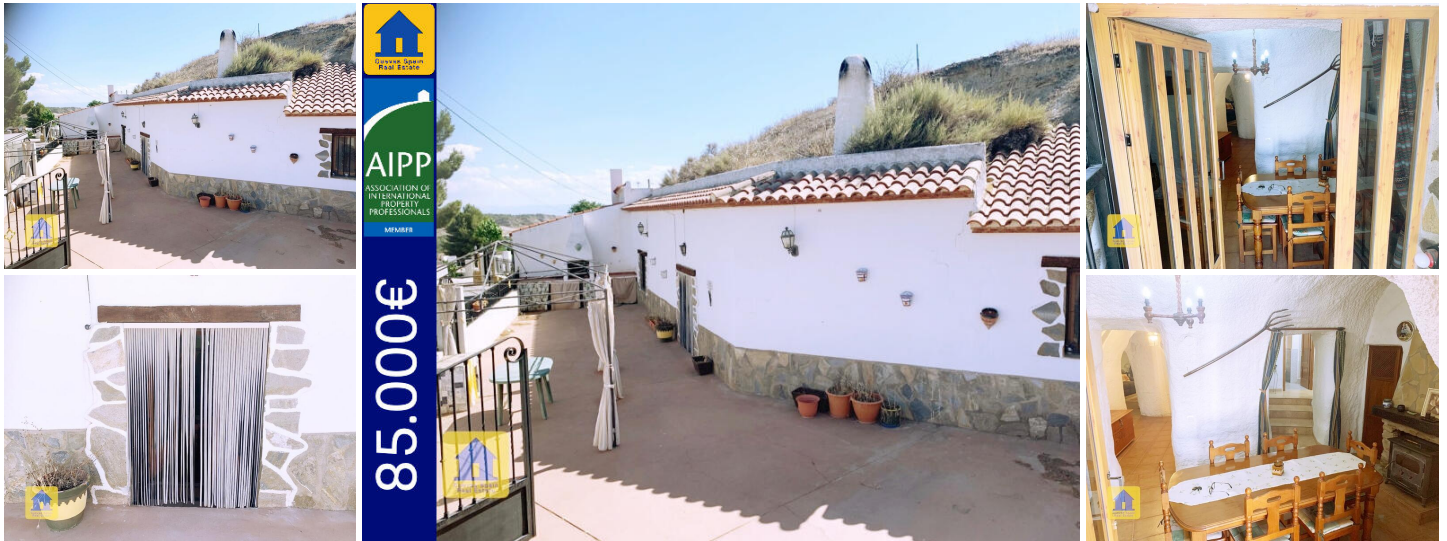
Cueva Leslie Los Olivos

Beautiful 3 bedroom cave in the quiet hamlet of Los Olivos. The property faces east-south-east with views of the Badlands. It has a large, gated patio with a shaded sitting area, barbecue and parking space. The house is fully cave with the exception of the kitchen which is outbuild. The entrance is through the dining room which has a wood burner, fireplace and storage cupboard. To the left are two bedrooms; one with a window and built-in closet. Straight on from the dining room is a wide hallway lined with quality wooden storage units, leading to a large salon with a light well and wood burner, and the third bedroom with wooden wardrobe. To the right from the dining room is the carefully finished full bathroom and large, sunny, fully tiled kitchen. The walls and ceilings are covered with projected cement, which gives a curvy, uniform finish. The floor tiles are uniform throughout, (except in the bathroom). The cave is sold nicely furnished. This property is in an impeccable state, ready to move in.