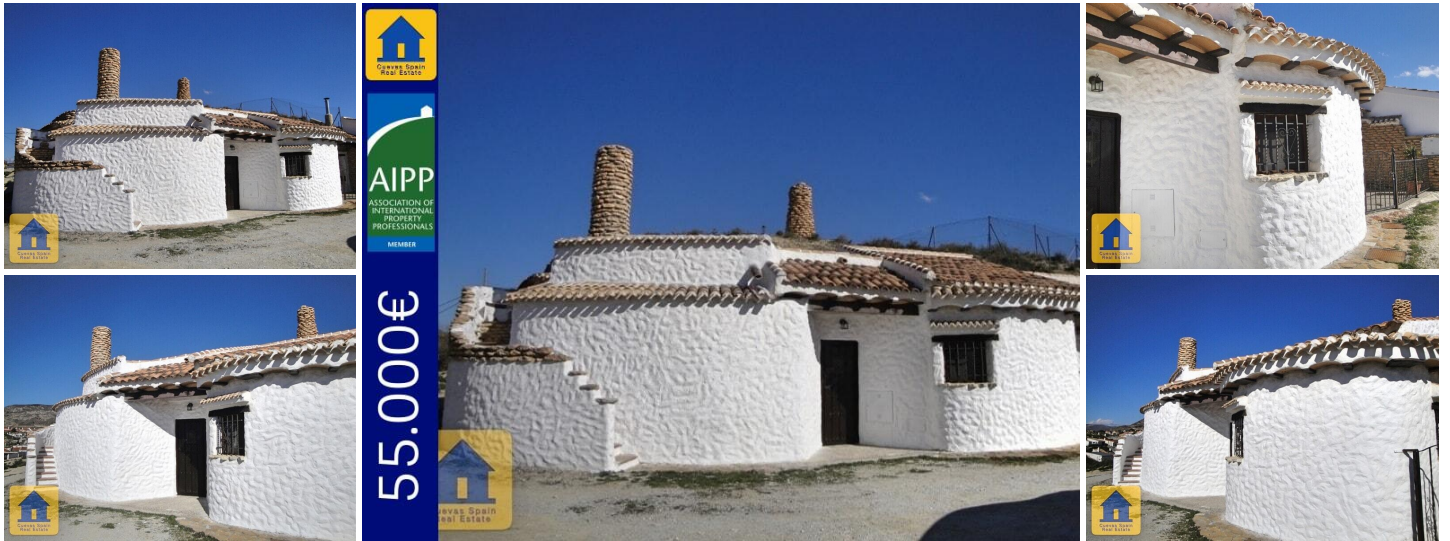
Huescar Cave House Paco

Lovely quirky cave house with tons of character, situated in a quiet elevated spot with fabulous views of Huescar. The sitting room has a fireplace with feature brickwork. The kitchen is sunny with views. The bathroom is spacious and beautifully finished. There are currently 3 bedrooms, 2 of which are walk-through. You have the option to adjoin the middle bedroom to the kitchen, creating a dining room and 2 private bedrooms. Across from the cave is a sunny spot with marvellous views. This is public land used for parking and can also be a great spot to sit and watch the sunset. Alongside the cave is a staircase that leads up to the land above the cave. Along the way up the stairs is a cosy seating nook carved into the rock. Above the cave, you have expansive views of Huéscar and the surrounding mountains. With a little work, this could be a delightful rooftop terrace. Water and electricity are connected. Internet can be connected. This cave is in excellent condition, very well built and well maintained. The cave was recently refurbished and you can live in it immediately.