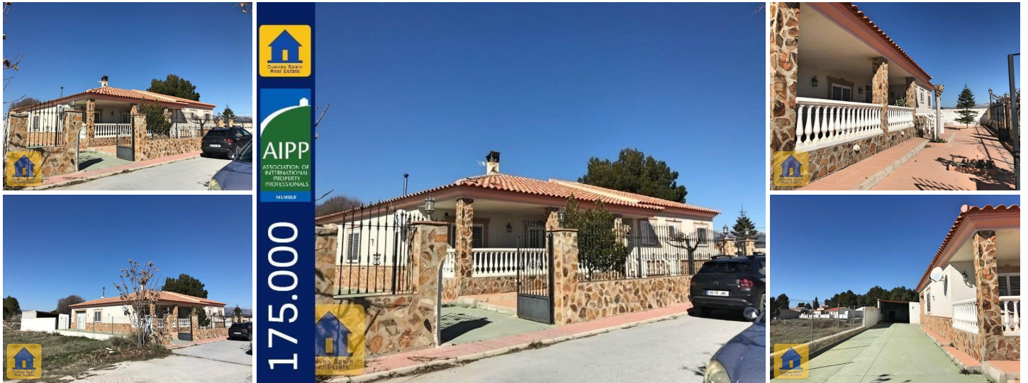
Los Olivos Villa Matilde

A beautiful and well built detached villa on a quiet location in Los Olivos, at short distance from the village Castillejar. The house has 3 large bedrooms and 2 bathrooms, a large kitchen diner, a large sitting room, a utility room, and 2 garages. Central heating on oil or pellet burner. Furniture stays. Outside is a shaded terrace and a large walled garden around the house. A house to be seen if you are looking for quality.