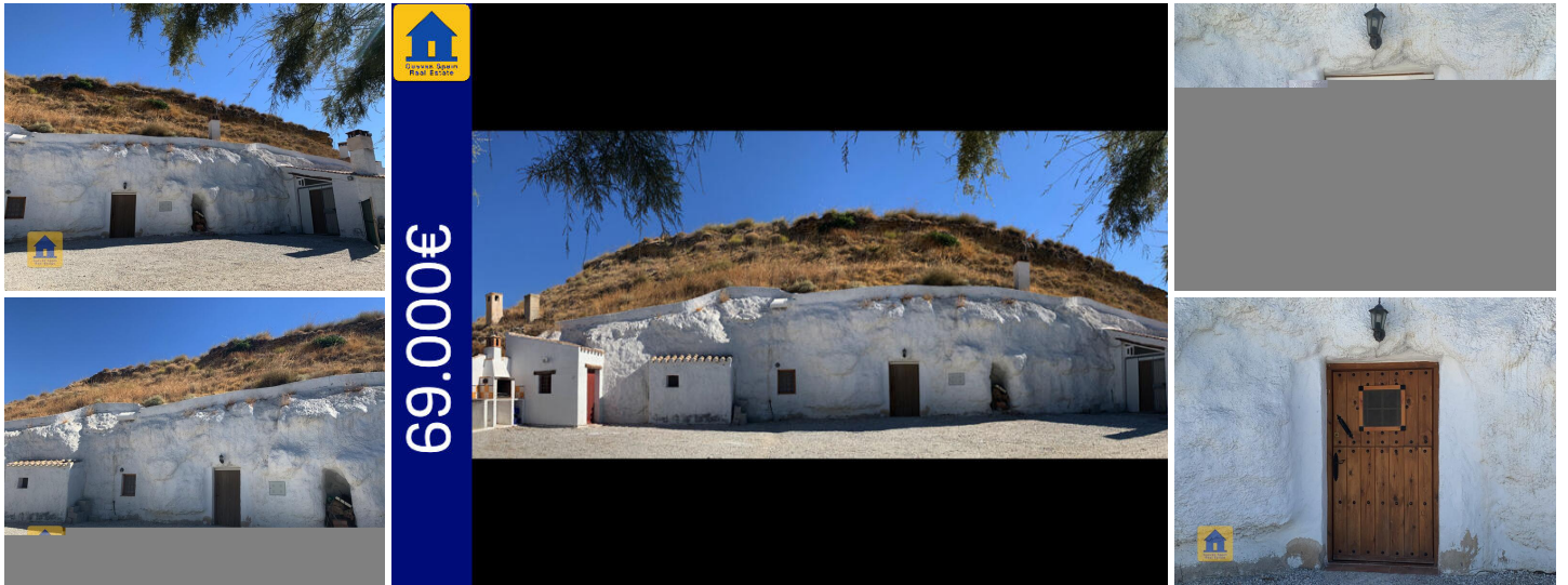
Cueva Enrique Galera Riego Nuevo

This is a traditional Spanish cave house situated in the beautiful countryside around Galera. The cave is large, well built but needs modernising. Inside the cave is a living room with a fireplace, kitchen, 5 bedrooms, 1 bathroom, and 3 partially reformed rooms for storage or pantry. This is mostly a pure cave with a large summer family room/kitchen outbuild that could also be a workshop or garage. The outbuild is insulated so it stays cool in summer, with a chimney and log burner for colder weather. The expansive patio offers great views of the surrounding mountains. The patio has a built in BBQ and ample space for parking and/or a swimming pool. Off the patio is a shed with a water reserve storage container and pump with a manometer to regulate the household water pressure. Across the dirt track in front of the patio is a shaded sitting area with room for parking or a garden. The property has been used as a holiday home for many years so it might benefit from layout adjustments and a 2nd bathroom for year round living. The property could also be split in two, with one part as a holiday let for an income. Galera village is about 5 min drive with amenities, restaurants, wine & tapas. The town of Huéscar is a 15 min drive, with 24 hr health center. If you are looking for a quiet area of natural beauty, Riego Nuevo is definitely worth seeing.