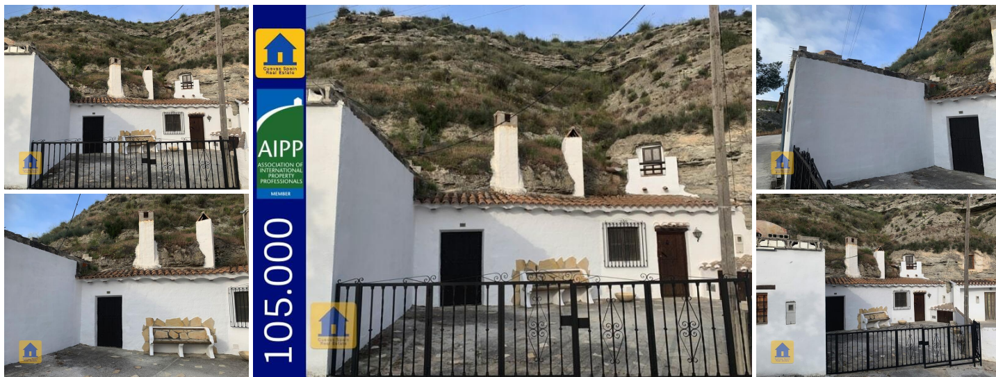
Galera cave house erik

Beautiful, quirky two-storey cave situated on the heights of Galera village. The property has 3-4 bedrooms and 2 bathrooms. The main floor has a central living room with wood stove that leads off in four directions: to the large kitchen; spacious master bedroom and bathroom; hall area which leads to a bathroom and to stairs to the upper floor; two ensuite front rooms that could be an office/bedroom, storage or playroom. The upper floor has 2 bedrooms, one with a Juliette balcony and views of the hills of Galera. The property has been repainted inside and out so it is in excellent condition and ready to move in. There is a nice, gated front patio with views. The patio could accommodate a bbq and sitting area or could be used for parking. Across from the cave is additional space with great views for a garden terrace or parking. This property is in a quiet location of Galera with very little passage. The village center and amenities are a 10 min walk.