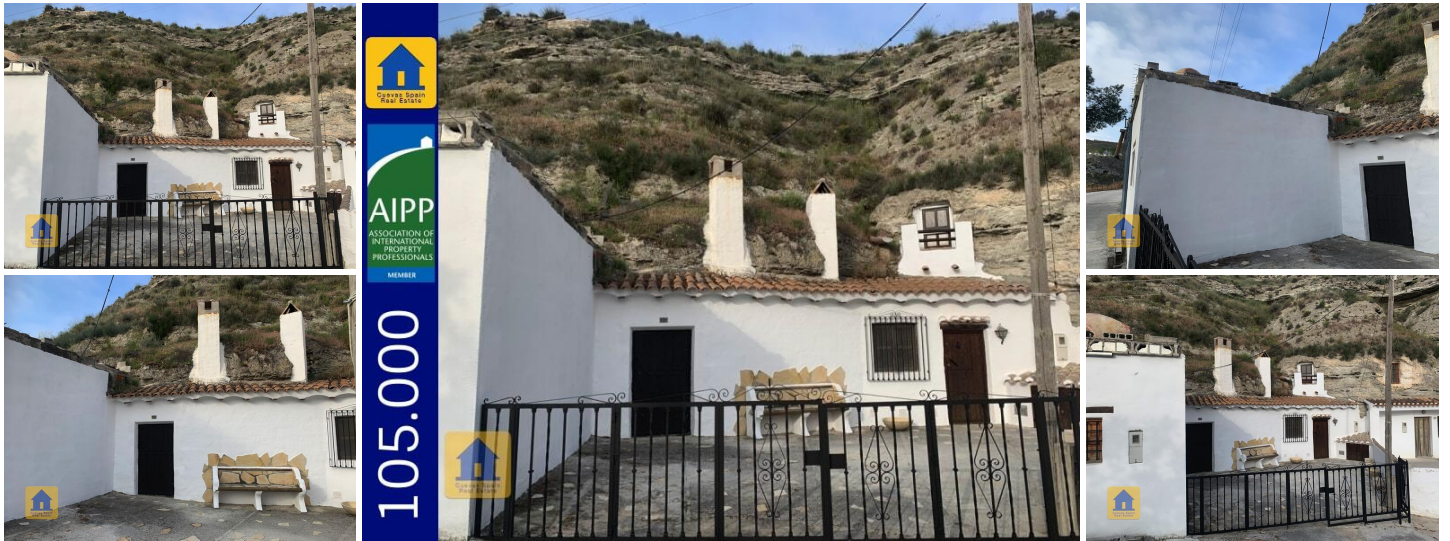
Galera cave house erik

Beautiful, quirky two-storey cave situated on the heights of Galera village. The property has 3-4 bedrooms and 2 bathrooms. The main floor has a central living room with wood stove that leads off in four directions: to the large kitchen; spacious master bedroom and bathroom; hall area which leads to a bathroom and to stairs to the upper floor; two ensuite front rooms that could be an office/bedroom, storage or playroom. The upper floor has 2 bedrooms, one with a Juliette balcony and views of the hills of Galera. The property has been repainted inside and out so it is in excellent condition and ready to move in. There is a nice, gated front patio with views. The patio could accommodate a bbq and sitting area or could be used for parking. Across from the cave is additional space with great views for a garden terrace or parking. This property is in a quiet location of Galera with very little passage. The village center and amenities are a 10 min walk.