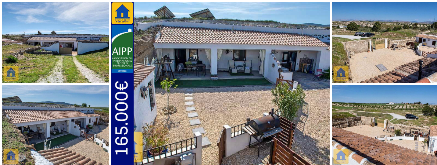
Cueva Michelle La Alqueria

This is a recently totally refurbished very cavy cave house (just finished this month) with nicely shaped and curved walls, it sits all alone in it's own little mountain, on the edge of the village La Alqueria. No Neighbours, and fantastic 360° views. Off the grid, with a brand new modern large enough solar system 5 Kw plus generator back up. No bills for electricity. Drinking-water is connected and a large septic tank.