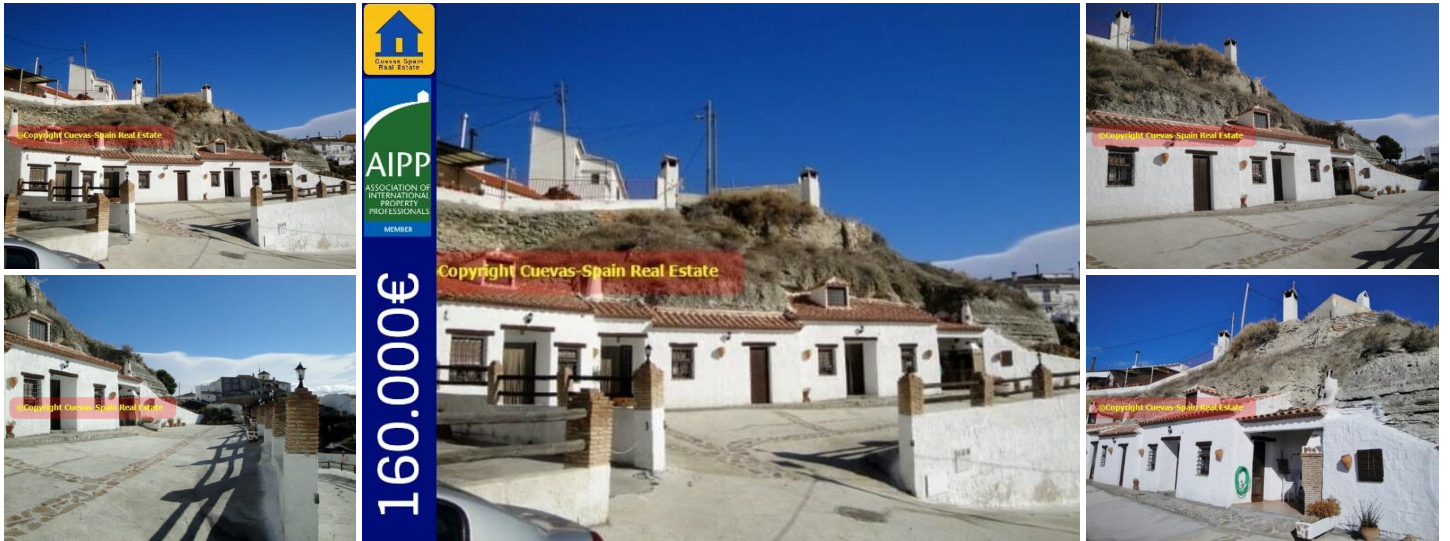
Hotel 3 cave houses la alqulayat.

Rural complex on the outskirts of Castillejar consisting of 3 beautiful Cave Houses. The tranquility and views are great here. The caves are on a quiet dead end road at the edge of town overlooking all of the surrounding areas. Now on sale for a good price with respect to quality and built m2. There are cave houses suitable for max. 9, 6 and 8 people, all with private terrace, communal barbecue and private parking. All are in excellent condition. The well known complex will be sold as a licenced running business, with website, contacts, and the caves include all furniture, kitchen, beds etc. All ready to continue immediately. Water and electricity are connected, telephone and internet are possible here.