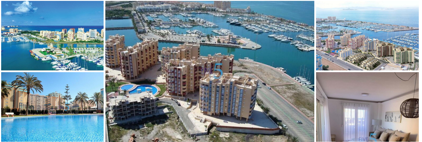
BEAUTIFUL SEA VIEW APARTMENTS IN LA MANGA

This urbanization is located in the largest expansion area of La Manga.