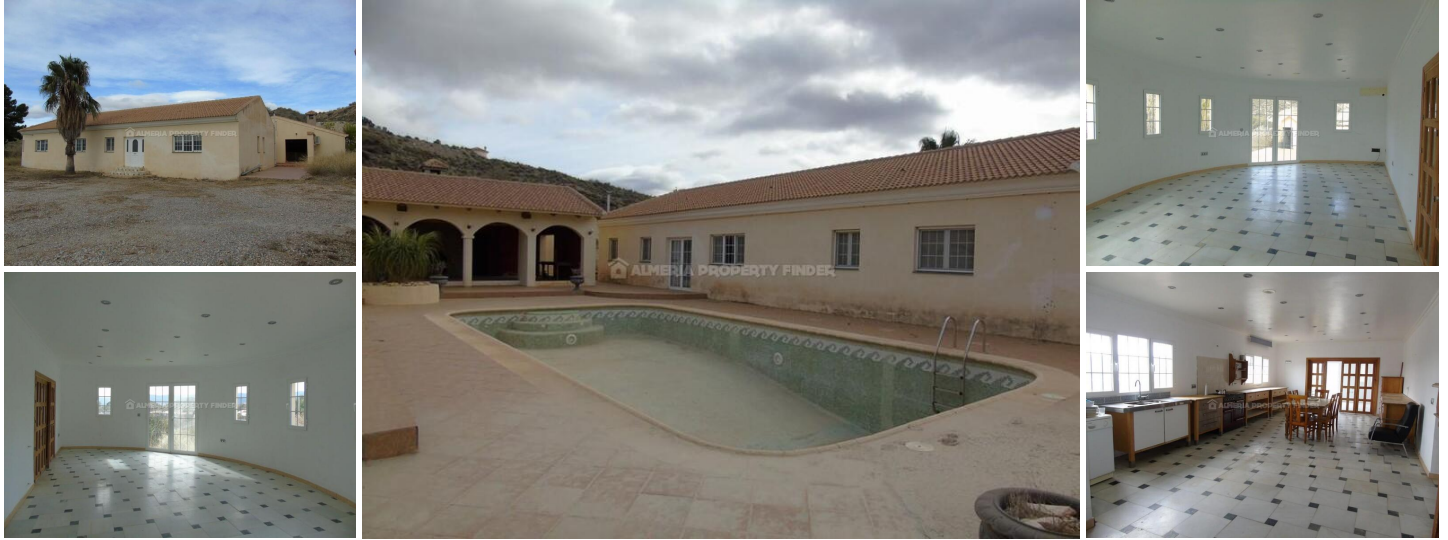
Villa Nova - A villa in the Partalaoa area. (Resale)

!!! EXCLUSIVE TO ALMERIA PROEPTY FINDER !!!