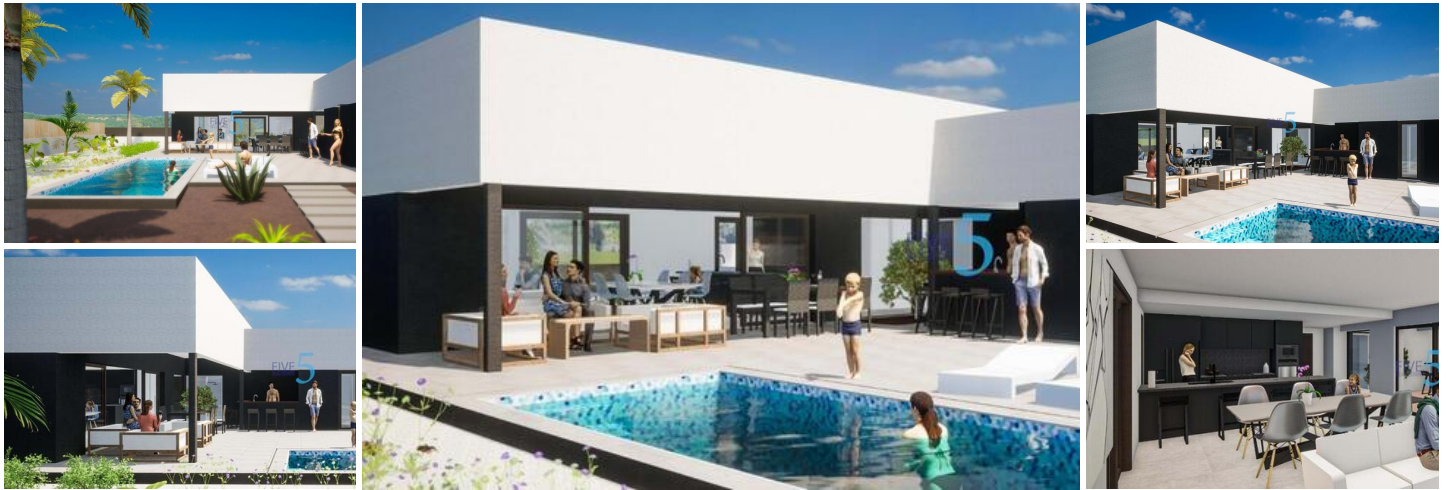
NEW BUILD VILLAS IN ALFAZ DEL PI

Fantastic New Build villas in Alfaz del Pi, close to the El Arabi urbanization. Connected to the urban centre of Alfaz del Pi (shops, sports centre, schools) and a few minutes from El Albir with easy connection.