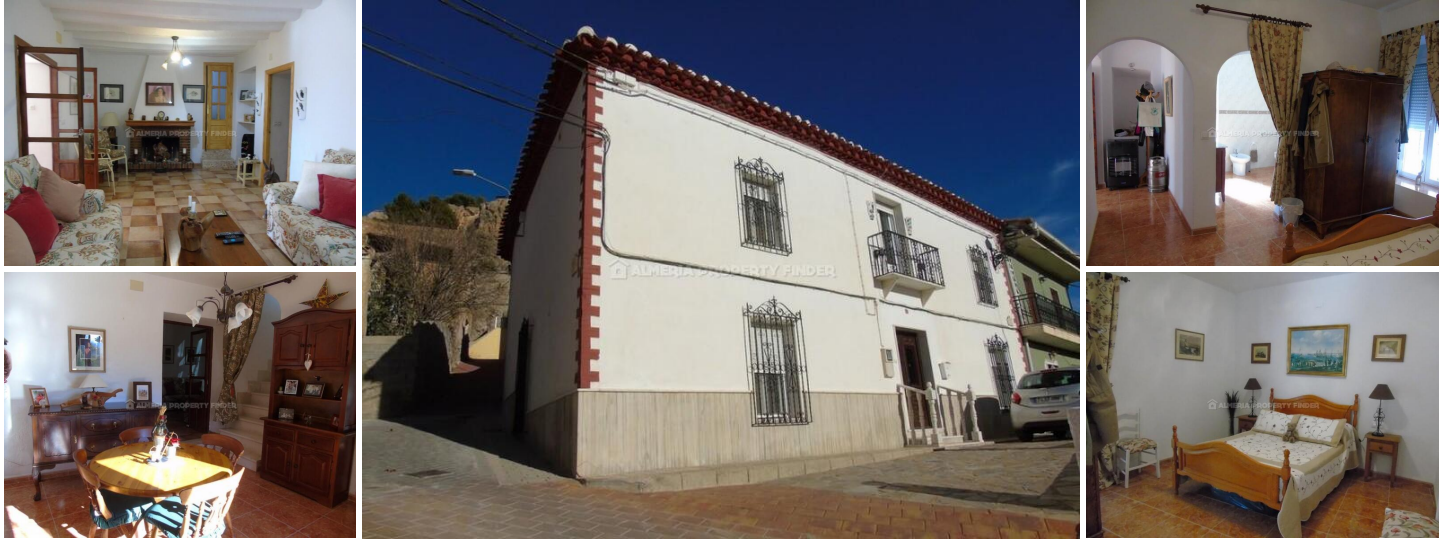
Casa Polaca - A town house in the Oria area. (Renovated)

This is a fabulous, large 3+ bedroom, 3 bathroom semi-detached town house for sale in Almeria, situated in the typically Spanish town of Oria within walking distance of all amenities.