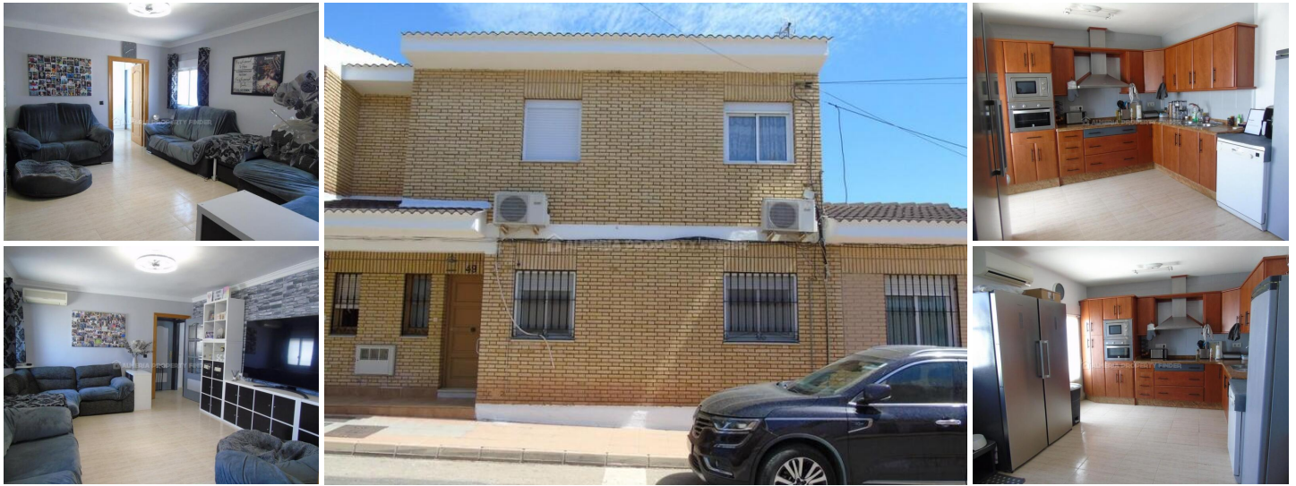
Casa Bletilla - A town house in the Zurgena area. (Resale)

An ideal low maintenance semi-detached 5 bedroom, 2 bathroom townhouse located in a quiet area of La Alfoquía, Zurgena. The property is just a short walk from the centre of La Alfoquia where amenities and leisure areas can be found such as: butchers, shops, restaurants, vet, medical center, gym and municipal swimming pool among others, around 12 minutes by car from Huércal-Overa and the popular market town of Albox, large commercial cities and approximately 25/30 minutes from the coast of the province of Almeria.