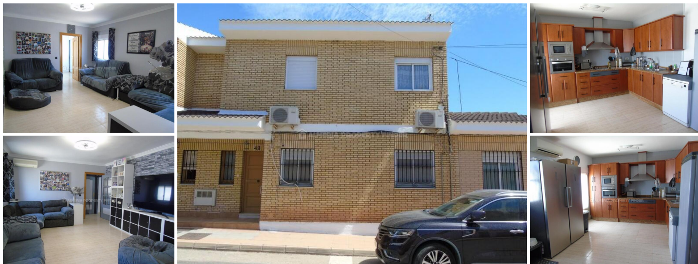
Casa Bletilla - A town house in the Zurgena area. (Resale)

An ideal low maintenance semi-detached 5 bedroom, 2 bathroom townhouse located in a quiet area of La Alfoquía, Zurgena. The property is just a short walk from the centre of La Alfoquia where amenities and leisure areas can be found such as: butchers, shops, restaurants, vet, medical center, gym and municipal swimming pool among others, around 12 minutes by car from Huércal-Overa and the popular market town of Albox, large commercial cities and approximately 25/30 minutes from the coast of the province of Almeria.