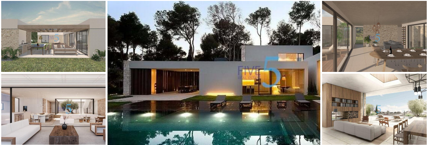
NEW BUILD VILLA IN YECLA, MURCIA

New Build exclusive luxury villa located within a beautiful vineyard in Yecla, Murcia.