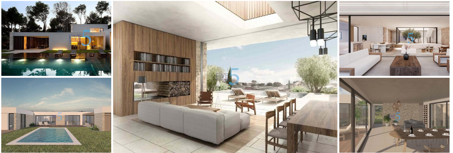
NEW BUILD VILLA IN YECLA, MURCIA

New Build exclusive luxury villa located within a beautiful vineyard in Yecla, Murcia.