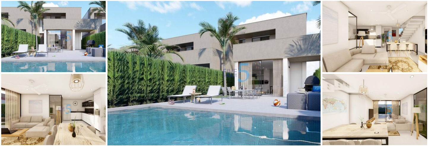
NEW BUILD VILLAS IN LOS URRUTIAS, MURCIA

New Build modern villa at 200m from the beach. The luminous villa build over 2 floors, has 3 bedrooms and 3 bathrooms.