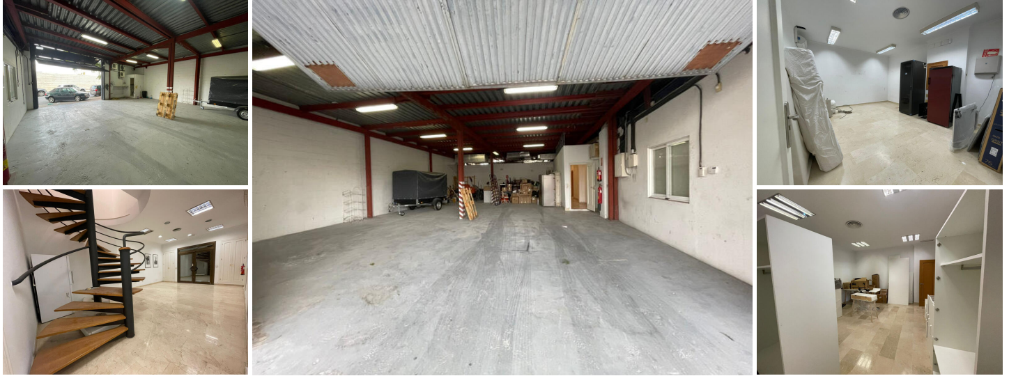
Warehouse, Marbella, Costa del Sol.

Setting : Beachfront, Town, Commercial Area, Beachside, Close To Golf, Close To Port, Close To Shops, Close To Sea, Close To Schools, Close To Marina.