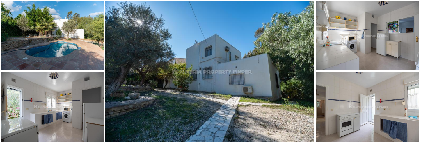
Villa Fernanda - A villa in the Mojácar area. (Resale)

A super country property located in the Micar Valley, Mojácar with 4 bedrooms, 3 bathrooms with guest annexe on a plot of 1430m 2 with views of the mountains and Mojácar village.