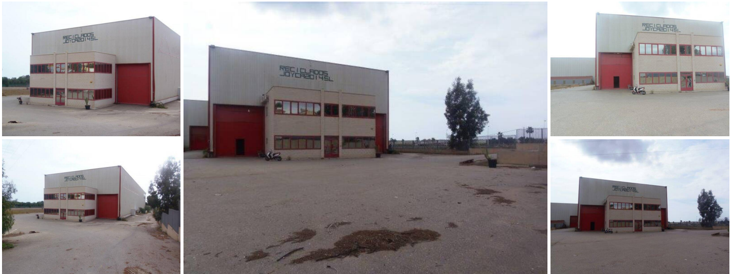
Commercial warehouse for sale in Palomares, Almería, Spain.

This commercial warehouse can be used for Wholesale. The size of the warehouse it's 1585m 2 on a plot of 3127m 2 . It has reception and fully furnished offices, toilets. With all the services of light and water connected.