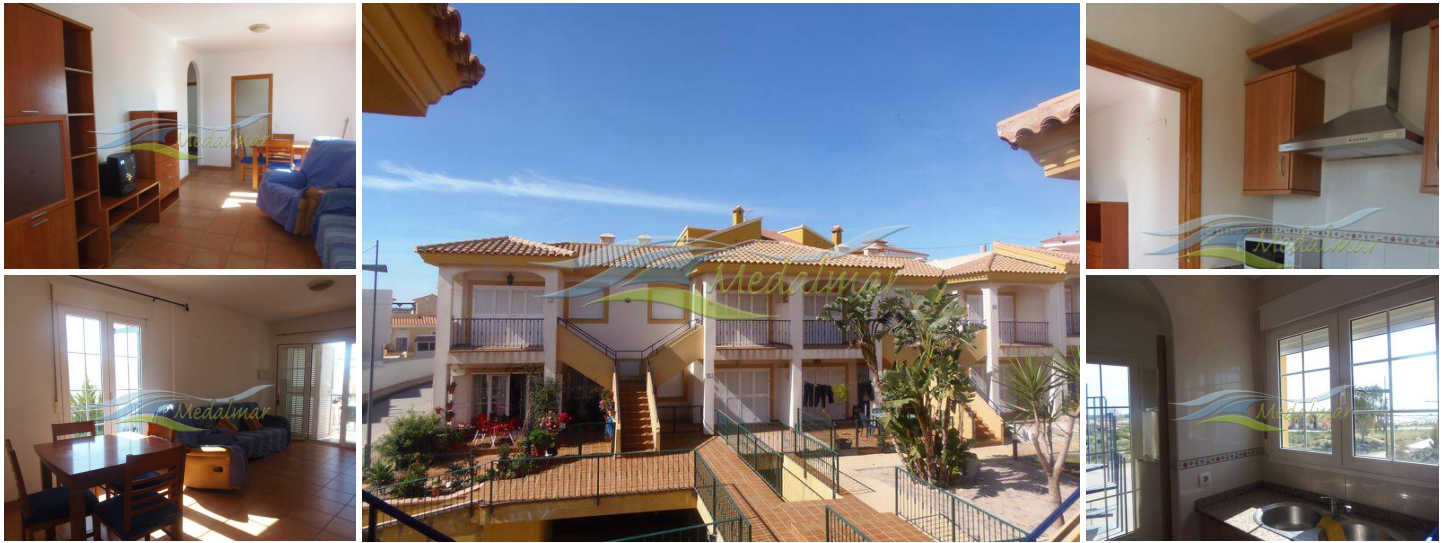
Penthouse with 2 bedrooms in Palomares, Almería, Spain.

Nice apartment on the first floor with 2 bedrooms, the apartment is located in the quiet urbanization of Valle del Almanzora. The property consists of 2 bedrooms with fitted wardrobes, 1 bathroom, living room very spacious and bright with access to a large front terrace and a side balcony from which you can enjoy unbeatable views of the coast. The kitchen is independent with several areas and a rear terrace from which you access a solarium with stunning views.