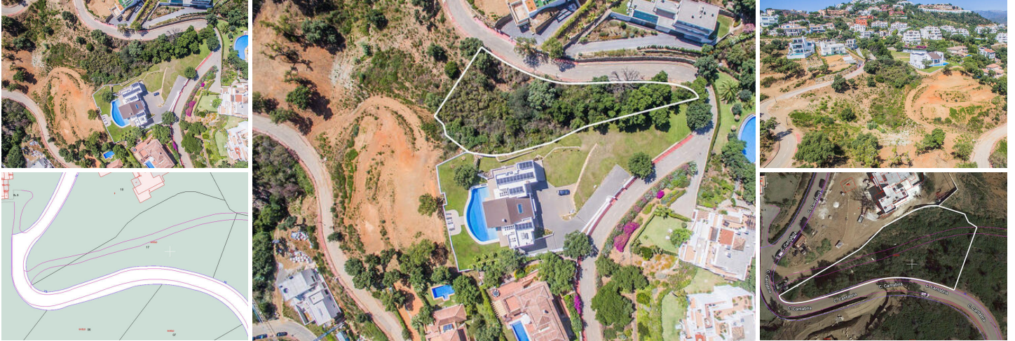
Plot 1506 La Mairena.

As the location is outstanding, in a protected environment, surrounded by the stunning mountains which sweep down to the sea, you will have without doubt the best views here on the Costa del Sol.