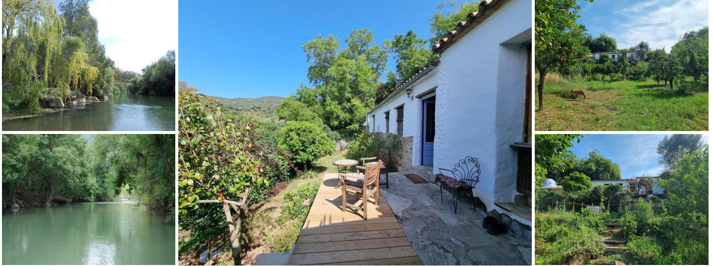
Idyllic riverside finca for sale near Gaucin ( El Colmenar – Estacio de Gaucin )

Sitting on a 5000m2 plot of organic fertile land which borders the Guardiaro river. The “ edge of the village location “ is ideal for those who love country life and peace, but also like to have facilities and neighbours close by ! The traditional white village of El Colmenar ( Estacion de Gaucin ) is one of particular charm – it has a small train station with several trains a day passing betweeb Ronda/Algeciras a huge advantage . The village is known as the gateway to the magnificent Alcornocales National Park , as this is the nearest entry point for access to the Cañon de Las Buitreras