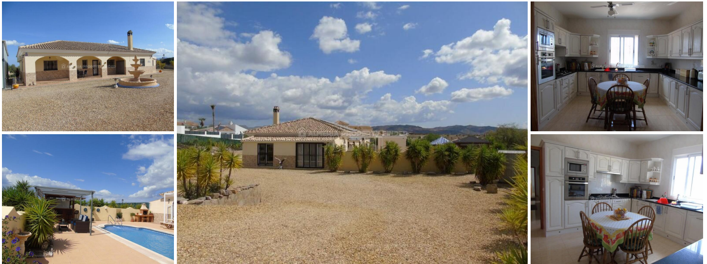
Villa Aguila - A villa in the Albox area. (Resale)

We are delighted to have been asked to market this impressive and very spacious detached villa on the outskirts of Albox town. Located within a 10 to 15 minutes walk of all the amenities that this market town has to offer including pavement tapas bars and cafes, restaurants shops, a 24 hour medical centre, cinema, sports facilities and a weekly street market on Tuesdays. The villa's location offers peace and tranquillity yet close to facilities and due to the plot of 2650m there are neighbours so as not to feel isolated but far enough away to guarantee privacy.