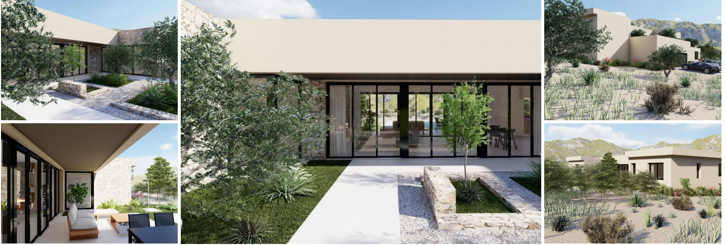
NEW BUILD VILLA IN YECLA, MURCIA

New Build exclusive luxury villa located within a beautiful vineyard in Yecla, Murcia.