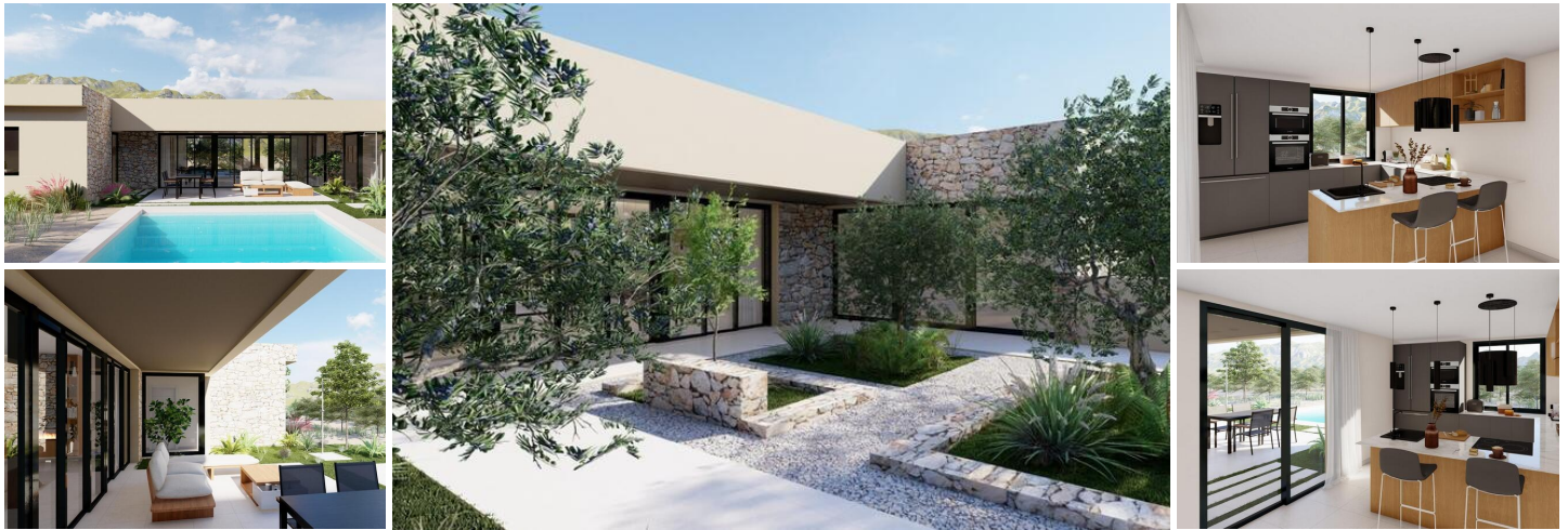
NEW BUILD VILLA IN YECLA, MURCIA

New Build exclusive luxury villa located within a beautiful vineyard in Yecla, Murcia.