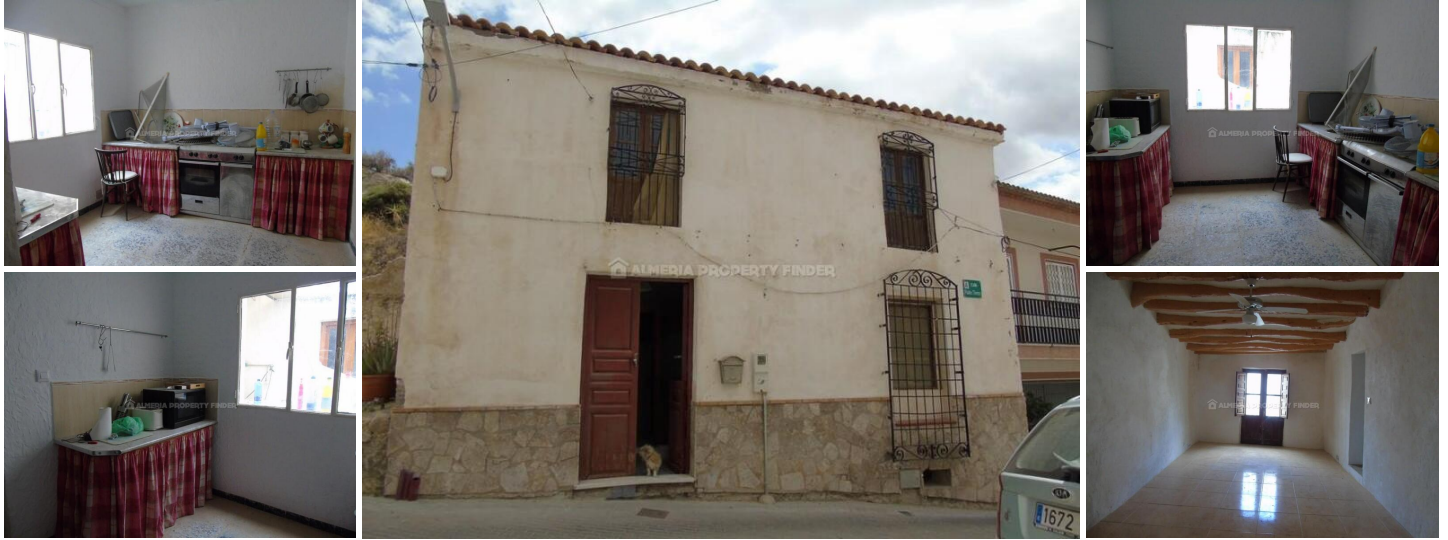
Casa Bodega - A town house in the Zurgena area. (Partially Reformed)

This large partly renovated 6 bedroom, 4 bathroom townhouse with a build of 300m 2 courtyard garden is for sale in situated in the old part of the small town of Zurgena, within easy walking distance of the town's amenities. Zurgena is a traditional Spanish village where the general hussle and bussle of village life is centered around the village square and it's bars which all serve tapas long into the evening. Other facilities include a kiddies' play park the newly constructed sports barn, 2 mini-markets, a bakers, 2 banks and two convenience stores.