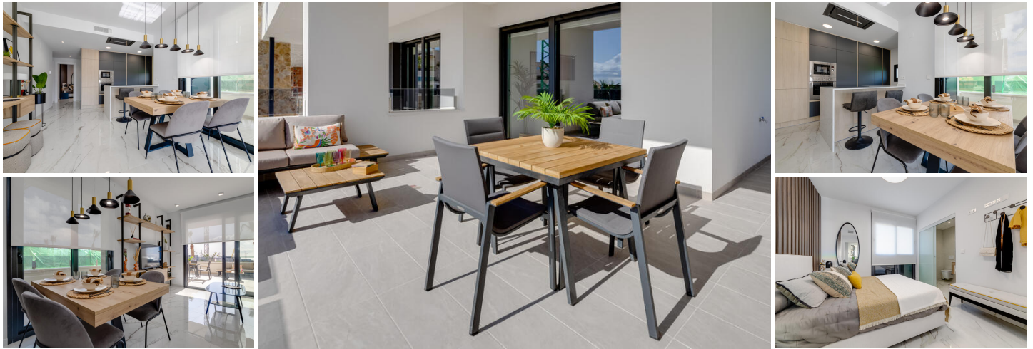
Amanecer de Luxe are All Inn Apartments for sale in Playa Flamenca

These luxury apartments for sale in Playa Flamenca are sold inclusive of all furniture and ready to move in.