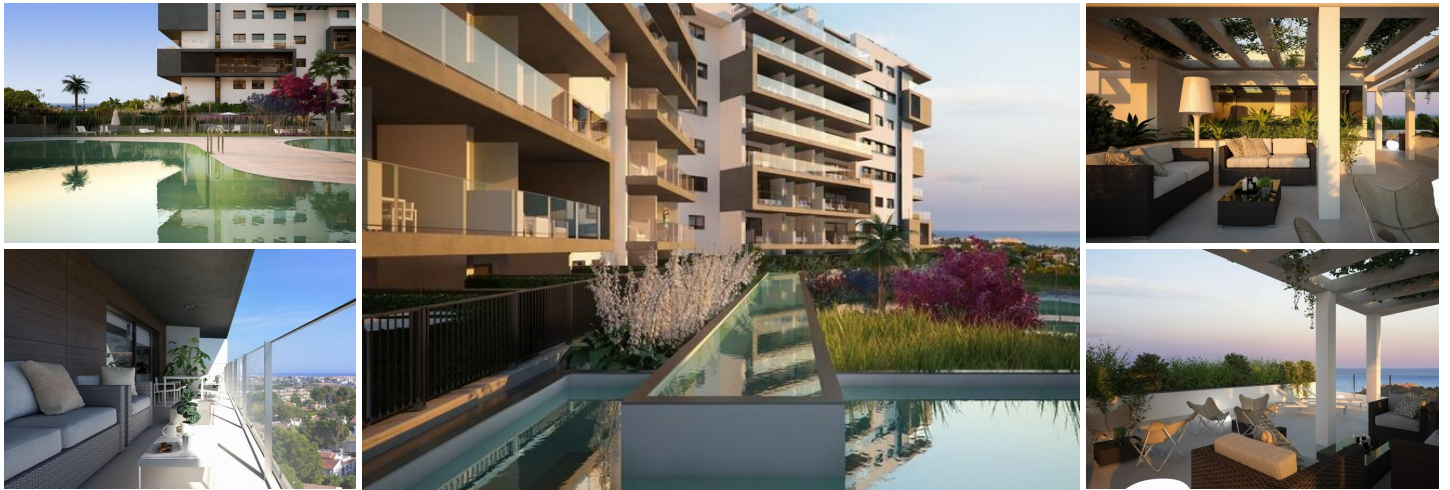
GROUND FLOOR FLAT IN LUXURY RESIDENTIAL COMPLEX NEXT TO THE SEA

Imagine a place where the sea and nature become the protagonists of an incredible story: yours. Imagine an environment where you can give free rein to your imagination and live a thousand adventures by land sea. Welcome to this new Residential in Campoamor, the home where you can live the life you have always dreamed of with the most beautiful horizon in the background: the Mediterranean.