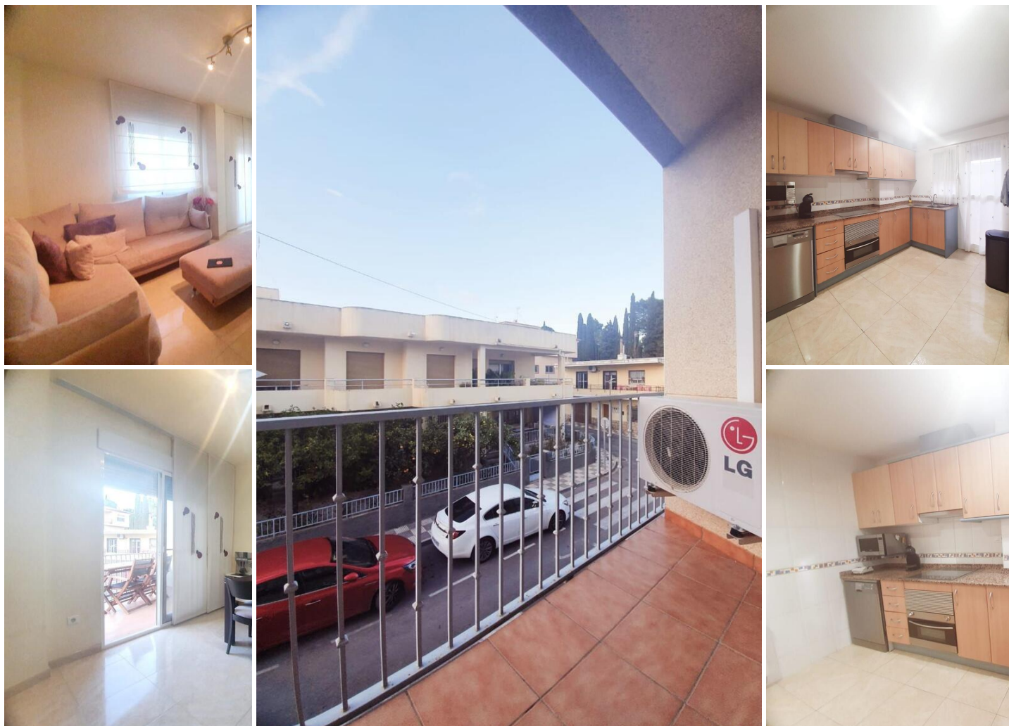
Centrally located apartment in Polop

Apartment is situated close to the centre of Polop, close to all services, like different, commercial premises, public transports.