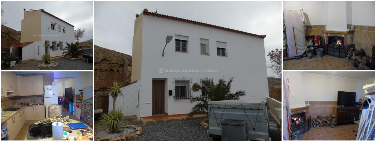
Cortijo Adela - A country house in the Oria area. (Resale)

A great two storey 3 bedroom, 2 bathroom country house with a build of 105m 2 situated in a very small neighborhood with a few other houses 10 minutes away from the traditional Spanish town of Oria which offers all amenities including supermarkets, bars, restaurants, banks, bakery, butcher, 24 hour medical facilities, pharmacy, a petrol station, ironmongers and a weekly market every Sunday.