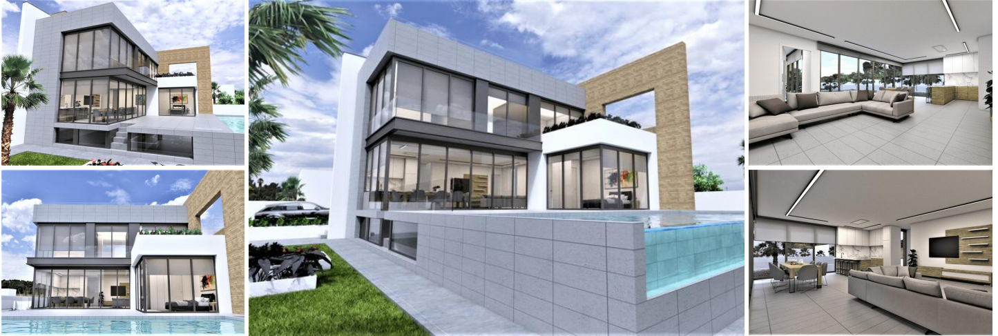
LUXURY NEW BUILD VILLA NEAR LA ZENIA BEACH

New Build villa with sea views in the beautiful area of "La Zenia".