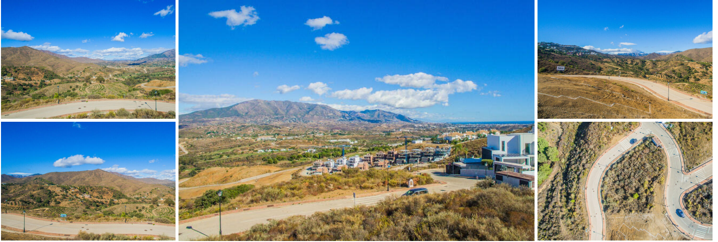
Sector13 Plot 42

Almost flat plot with panoramic sea and mountain views.