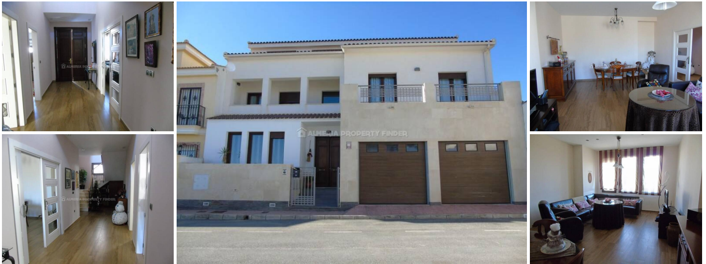
Casa Moderno - A town house in the Albox area. (Resale)

Large modern 5 bedroom, 4 bathroom townhouse with garage situated in the popular market town of Albox. With a generous build size of 385m 2 , this bright & spacious 3 storey property would make an ideal B&B / guest house or a lovely family home. The property is situated within easy walking distance of all amenities including shops, supermarkets, schools, cafes, tapas bars, restaurants, sports facilities and a 24 hour medical centre.