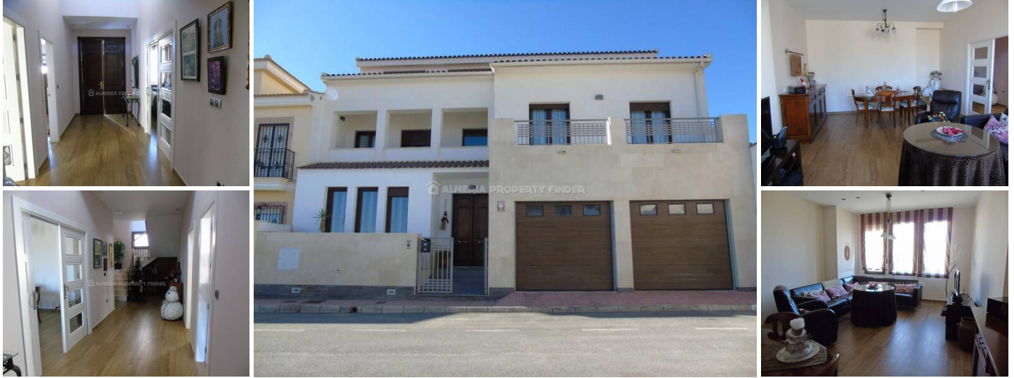
Casa Moderno - A town house in the Albox area. (Resale)

Large modern 5 bedroom, 4 bathroom townhouse with garage situated in the popular market town of Albox. With a generous build size of 385m 2 , this bright & spacious 3 storey property would make an ideal B&B / guest house or a lovely family home. The property is situated within easy walking distance of all amenities including shops, supermarkets, schools, cafes, tapas bars, restaurants, sports facilities and a 24 hour medical centre.