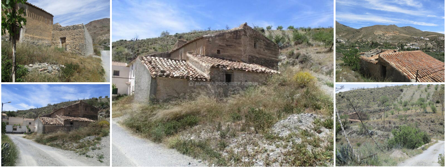
Ruina de los Adrianes - A country house in the Oria area. (Complete Ruin)

Fabulous two storey cortijo for complete renovation, situated in a beautiful rural hamlet in the Rambla de Oria area, within walking distance of a bar and around 15 minutes drive from the town of Oria which offers all amenities.