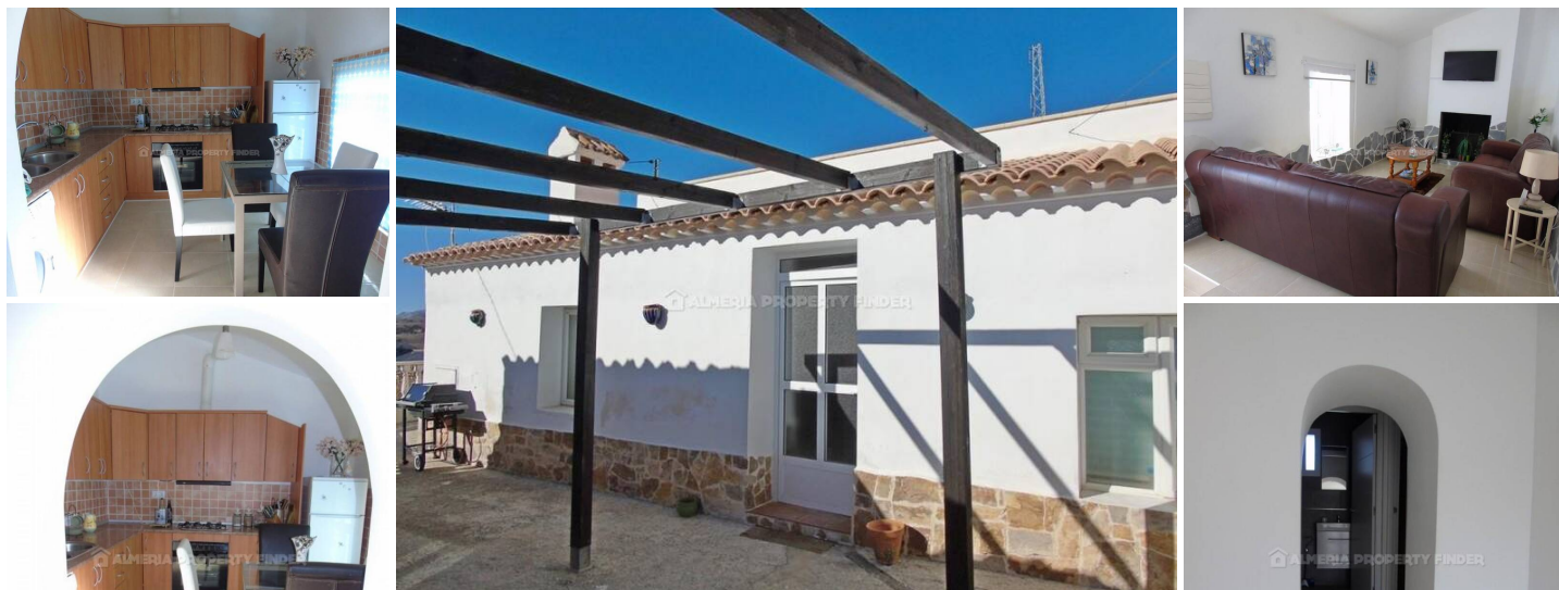
Casa Marie Uno - A village house in the Oria area. (Resale)

Fantastic south facing 2 bedroom village house situated in the sleepy hamlet of El Margen, only 3km from a village with bars / restaurants. El Margen is situated around 15 minutes drive from the towns of Oria and Chirivel which offer all amenities.