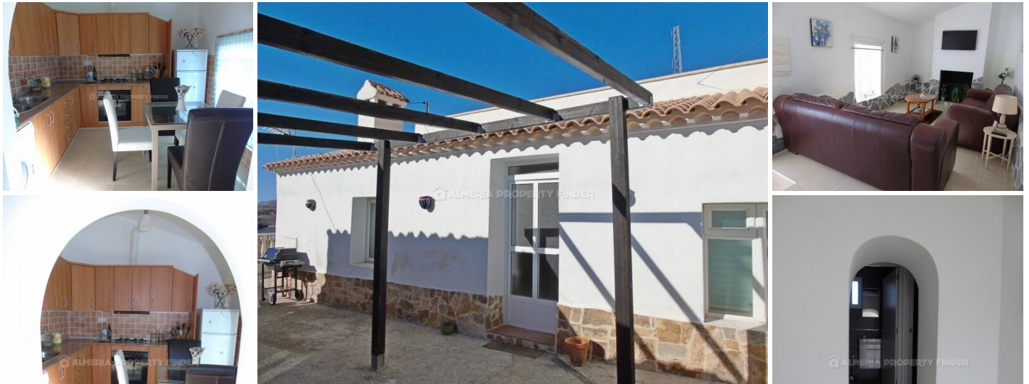
Casa Marie Uno - A village house in the Oria area. (Resale)

Fantastic south facing 2 bedroom village house situated in the sleepy hamlet of El Margen, only 3km from a village with bars / restaurants. El Margen is situated around 15 minutes drive from the towns of Oria and Chirivel which offer all amenities.