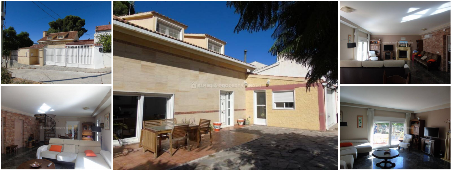
Casa Mari Carmen - A village house in the Purchena area. (Resale)

Modern 3 bedroom, 2 bathroom village house with double garage for sale in Almeria Province, situated between the towns of Olula del Rio & Purchena, both of which offer all amenities. There is also a bar / restaurant within easy walking distance.