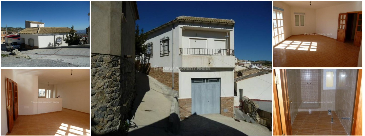
Casa Simón - A town house in the Lucar area. (Newly Built)

Newly built 3 bedroom townhouse for sale in Lucar, with a large garage / underbuild and a roof terrace with spectacular valley views, situated within easy walking distance of the town's amenities.