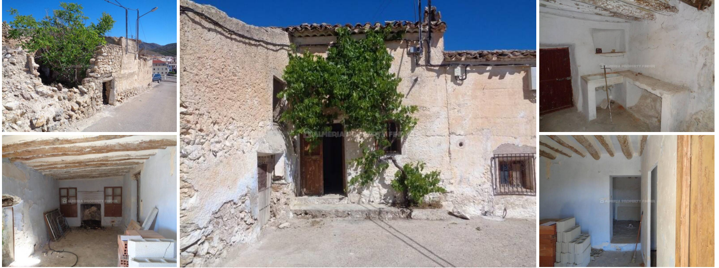
Casa Torres - A town house in the Oria area. (For Renovation)

!! REDUCED !! Semi-detached townhouse for complete renovation, situated in the town of Oria which has all amenities for daily life.