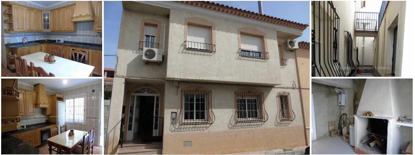
Casa Gloria - A town house in the Chirivel area. (Resale)

Fabulous 5+ bedroom townhouse situated in the lovely town of Chirivel which offers all amenities for daily living. The town has excellent access to the A92 motorway which leads to Granada and the Sierra Nevada ski resort in one direction, and to the coastal motorway and airports of Almeria, Murcia and Alicante in the other direction.