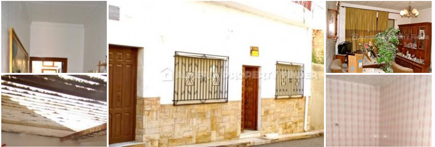
Casa Cantoria - A town house in the Cantoria area. (For Renovation)

A charming town house located in the popular village of Cantoria.