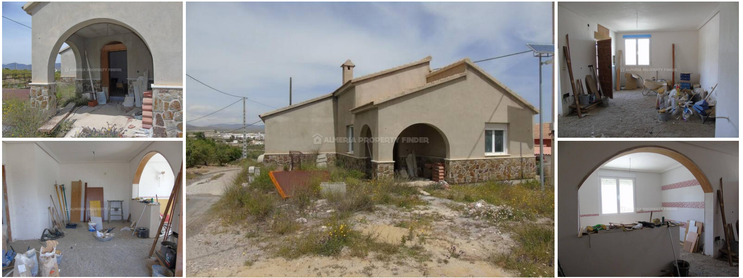
Villa Martinez 3 - A villa in the Cantoria area. (Newly Built)

!! REDUCED !! New build: Detached 3 bedroom villa for sale in Almeria Province, situated in a rural area with fantastic views between the towns of Cantoria and Fines.