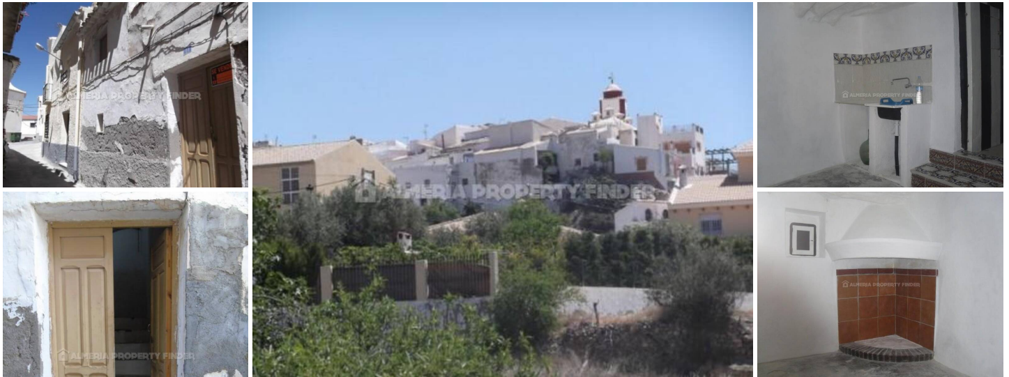
Casa Marion - A village house in the Somontin area. (Partially Reformed)

REDUCED!! Part renovated village house for sale in Almeria Province, situated in the beautiful mountain village of Somontin.