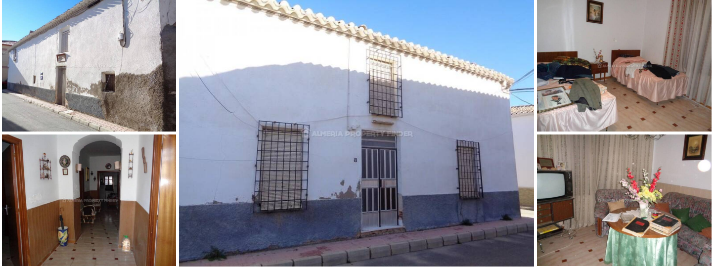
Casa Tania - A village house in the Albox area. (Habitable)

Huge semi-detached 4+ bedroom village house situated in a small village with basic amenities including a bar, bakery and pharmacy. The village is only 10 minutes from the large town of Albox which offers all amenities including shops, supermarkets, banks, schools, cafes, bars, restaurants, sports facilities and a 24 hour medical centre.