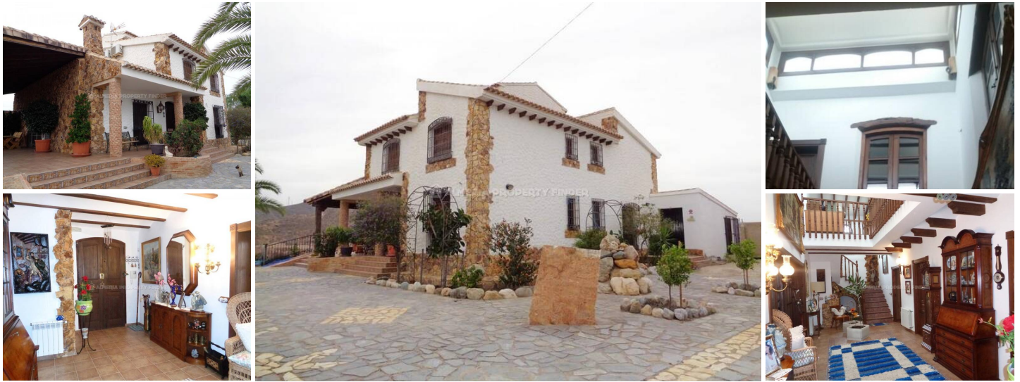
Finca Decoraciones - A country house in the La Alfoquia area. (Resale)

Authentic Spanish finca for sale in Almeria Province, comprising a unique 4 bedroom country house set in land of around 1100m 2 . The property is situated in the Alfoquia area with beautiful far reaching valley views.