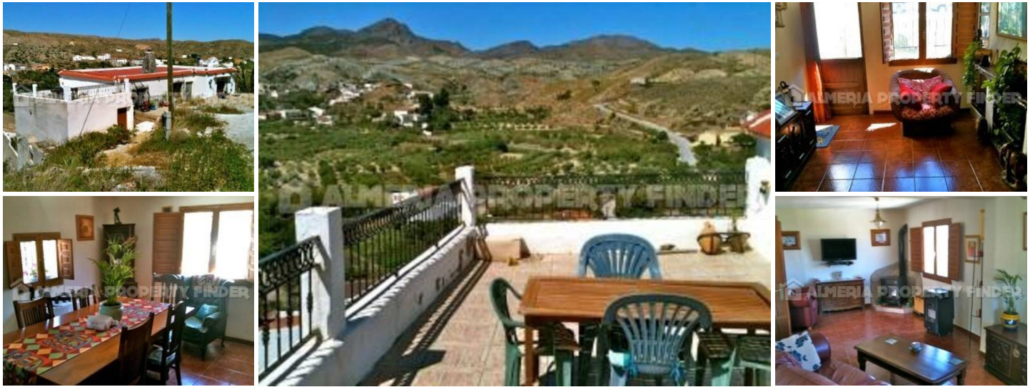
Casa Luca - A country house in the Oria area. (Renovated)

Versatile country property for sale in Almeria Province, situated in the Rambla de Oria area. Set in a plot of 336m 2 with fantastic views, the property comprises a two storey 4 bedroom house, a 2 bedroom guest annex in need of finishing work, and a separate 2 storey house in need of complete renovation.