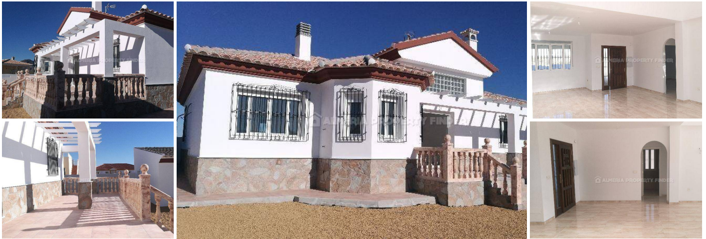
Villa Alegra - A villa in the Arboleas area. (Off Plan)

Off plan: Bright & airy single storey 4 bedroom villa with detached 21m 2 garage, to be built on a plot in the popular area of Arboleas, Almería.