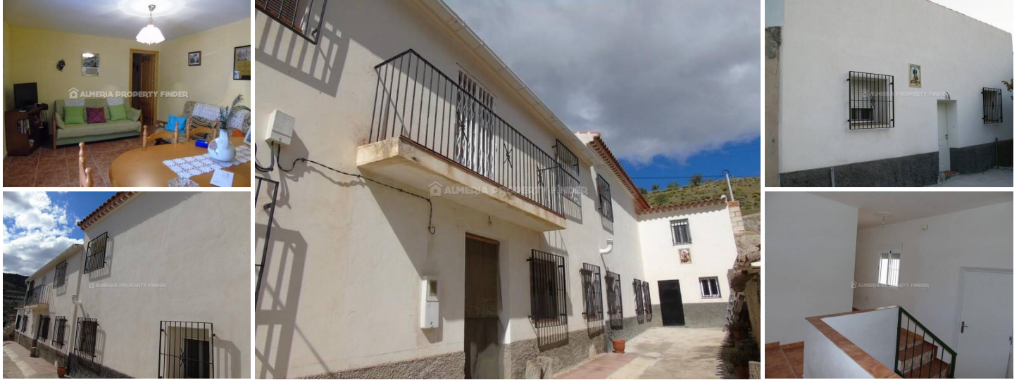
Casa los Finos - A village house in the Oria area. (Renovated)

Reduced for quick sale! Fabulous 5/6 bedroom village house situated in a small rural hamlet near to the village of los Cerricos which has a supermarket and tapas bars. The hamlet is serviced by various mobile shops and the towns of Oria & Chirivel which offer all amenities are around a 20 minute drive.