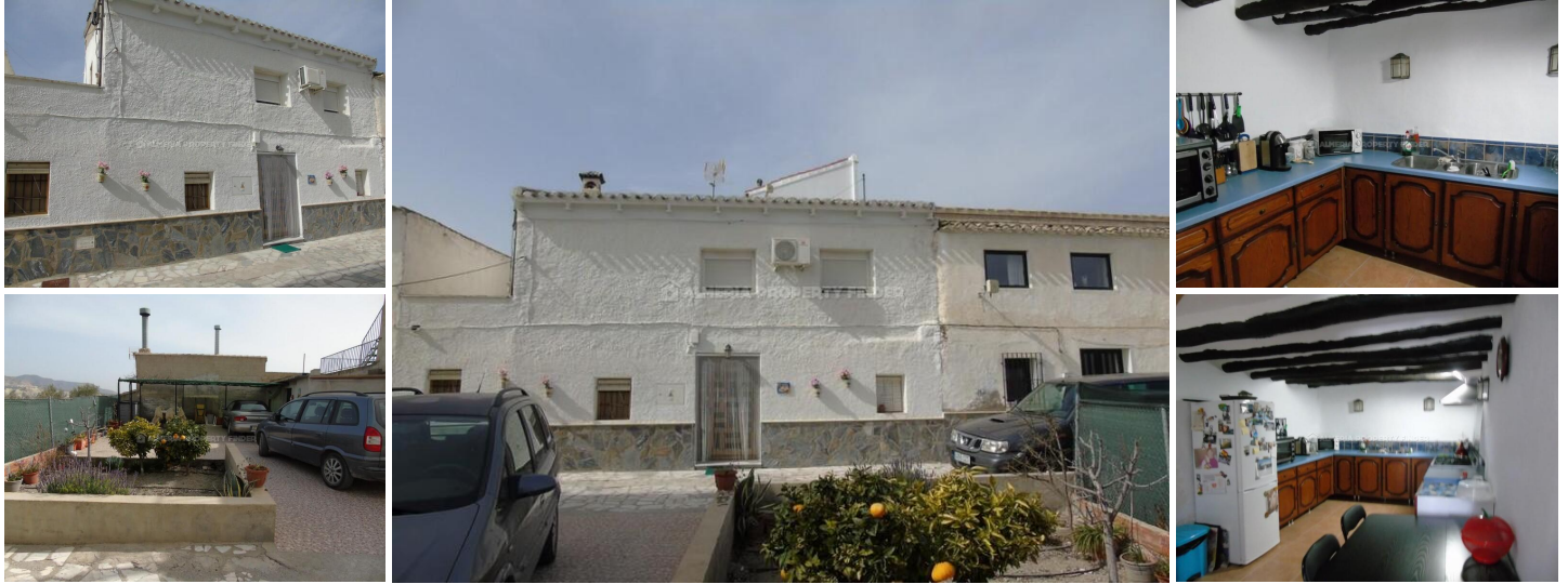
Casa la Huerta - A village house in the Lucar area. (Renovated)