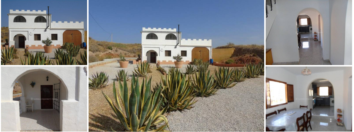
Casa Dash - A country house in the Oria area. (Resale)

Fabulous two storey 3 bedroom country house for sale in Almeria Province, situated in a tranquil rural area of Oria with fantastic far reaching views.