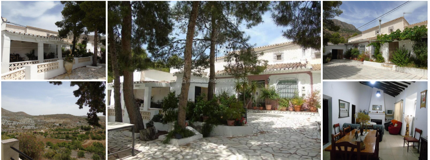
Cortijo Fuente del Oro - A country house in the Albox area. (Partially Reformed)

Habitable end of terrace 3+ bedroom country house with land of 18.534m 2 , situated in the beautiful rural area of Saliente Alto with stunning valley views. The property is situated around 20 minutes drive from the town of Chirivel which offers all amenities for daily living, and 30 minutes from the larger town of Albox.