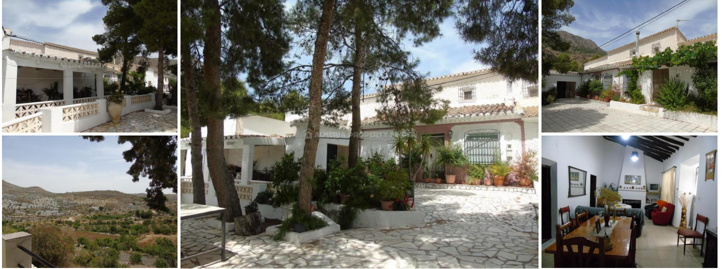
Cortijo Fuente del Oro - A country house in the Albox area. (Partially Reformed)

Habitable end of terrace 3+ bedroom country house with land of 18.534m 2 , situated in the beautiful rural area of Saliente Alto with stunning valley views. The property is situated around 20 minutes drive from the town of Chirivel which offers all amenities for daily living, and 30 minutes from the larger town of Albox.